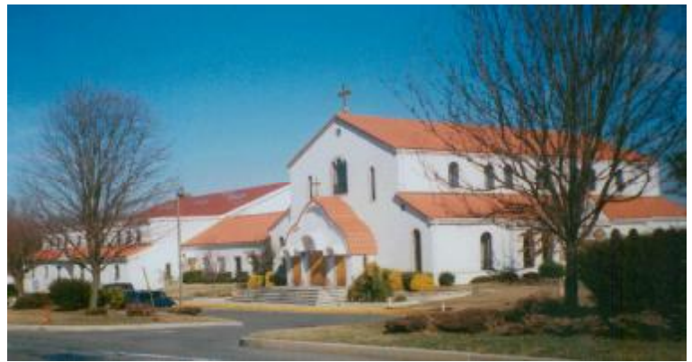
CONSECRATION OF KIMISIS TIS THEOTOKOU OCT 20-21,2007