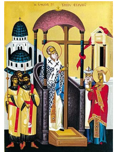
Exaltation of the Holy Cross

As Moses lifted the serpent in the wilderness, says Jesus, so must the Son of man be lifted upon the cross that whoever believes in Him might have eternal life. Thus, every year on this Feast, the Church raises the cross in our midst. She raises it so that we today may find healing and strength in the uplifted cross of Christ. For we, too, become infested with the deadly poison of sin and guilt. Salvation for us, too, is in a look-a